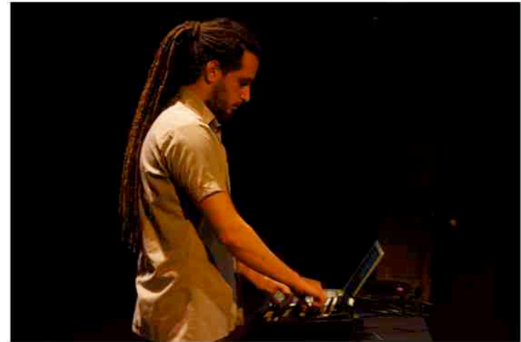
live @ The Chapel Performance Space, Seattle, USA, Dec 2010